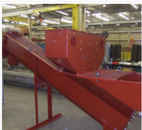
Shafted classifiers can be equipped with a screw lift assembly for ease of maintenance.