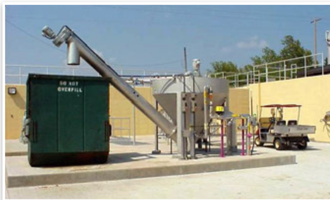
Grit Washer for exceptionally clean and dry grit.