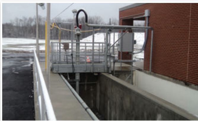
Bridges can be fitted with scrapers and/or pumps for grit removal.