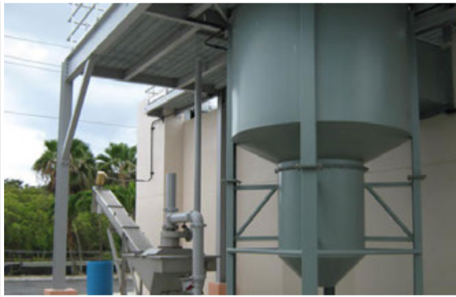
Optional steel tank design.

Kusters Water has been directly involved in the design, manufacture, supply, start up and testing of the XGT™ vortex grit removal technology since 1984. Based on experience with many installations, we have introduced a number of significant improvements to the system. These include the sloping floor design, self-priming grit pump, grit washer and X-impeller. The XGT™ vortex grit system is designed to efficiently remove both fecal and vegetable matter ( corn, rice, beans, peas etc. ) from the grit in the grit chamber resulting in cleaner grit with considerably lower organic content.