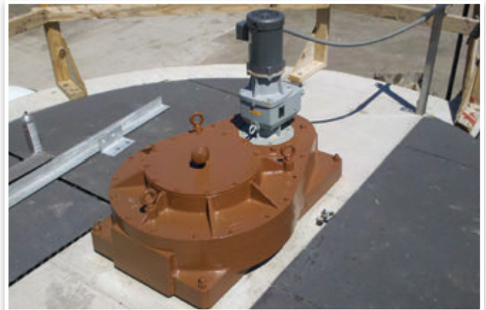
Submersible gear head.