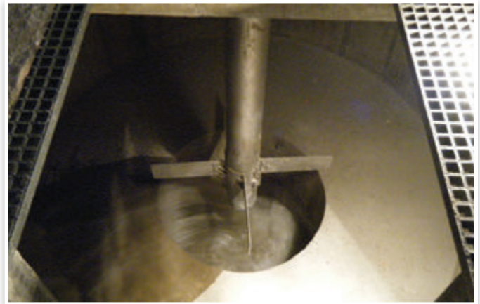
High efficiency X-impeller.